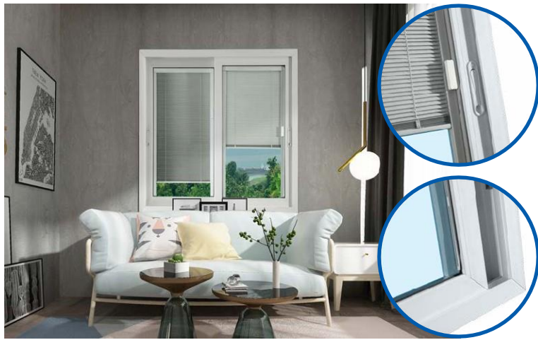
Built-in shutter sliding window