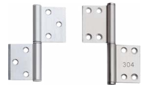
Left aluminum hinge, right 304 hinge