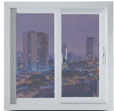
Two-track sliding window

Anti-corrosion/no deformation/safe and durable/selected materials