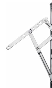
Casement window sliding support