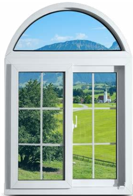
With arc sliding window with partition