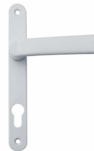
Swing door handle