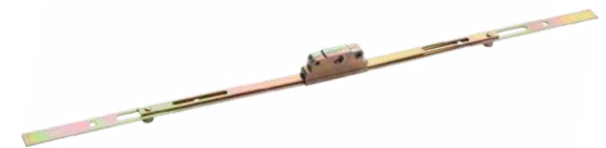
Casement window, door actuator