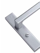
Bathroom door handle