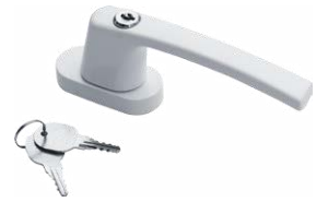
Double-sided handle with key for hinged door