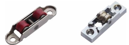
Rubber wheel double wheel, galvanized single wheel