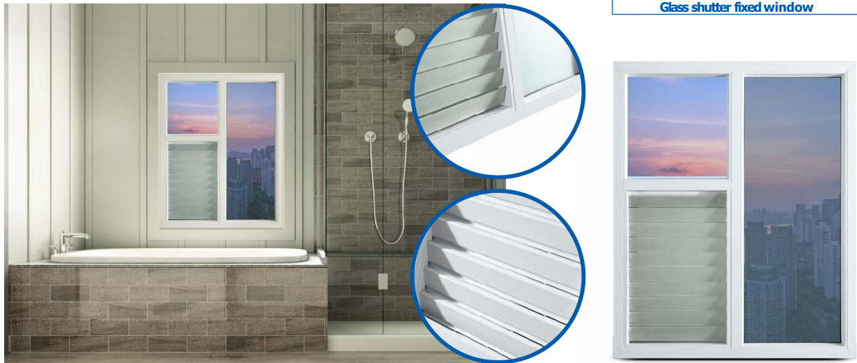
Glass shutter fixed window