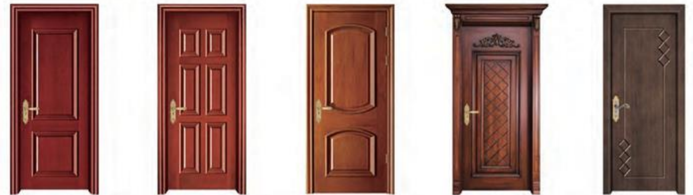
HTD-3011 HTD-3012 HTD-3013 HTD-3014 HTD-3015