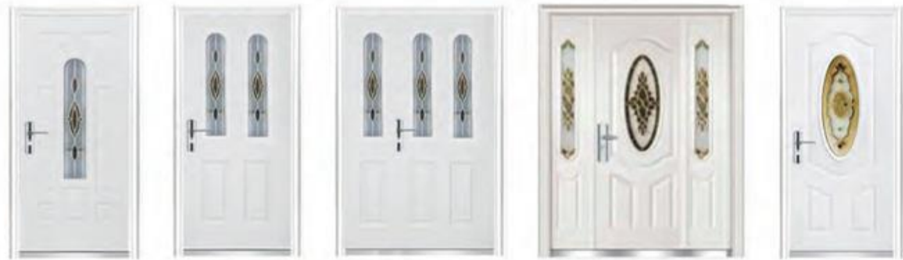
HTD-2076 HTD-2077 HTD-2078 HTD-2079 HTD-2080