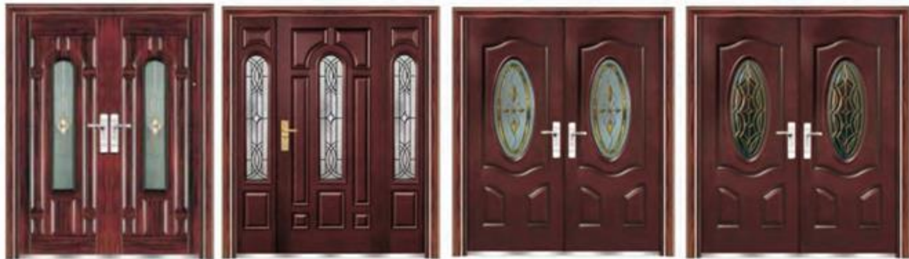
HTD-2086 HTD-2087 HTD-2088 HTD-2089