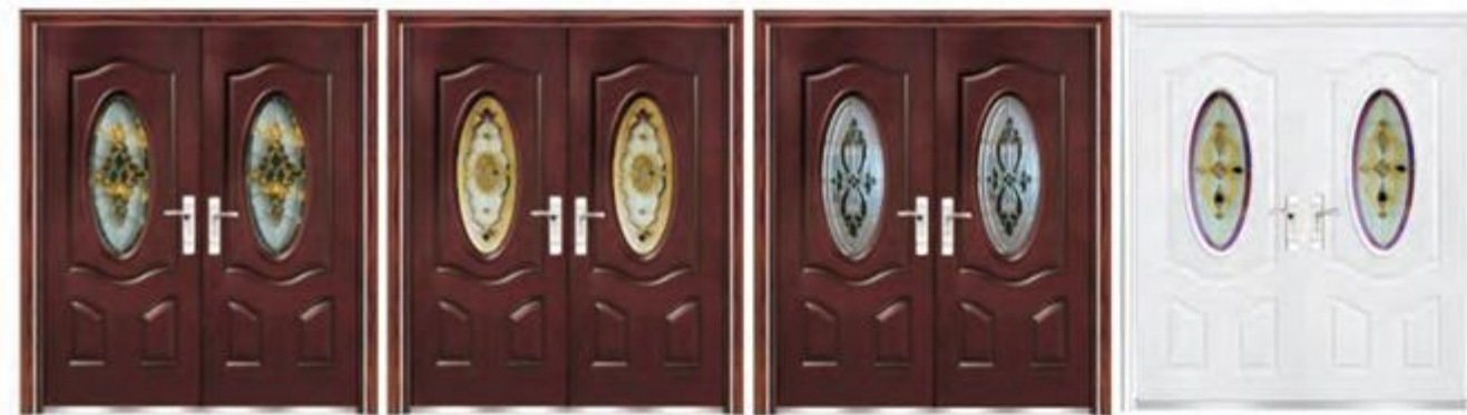
HTD-2090 HTD-2091 HTD-2092 HTD-2093