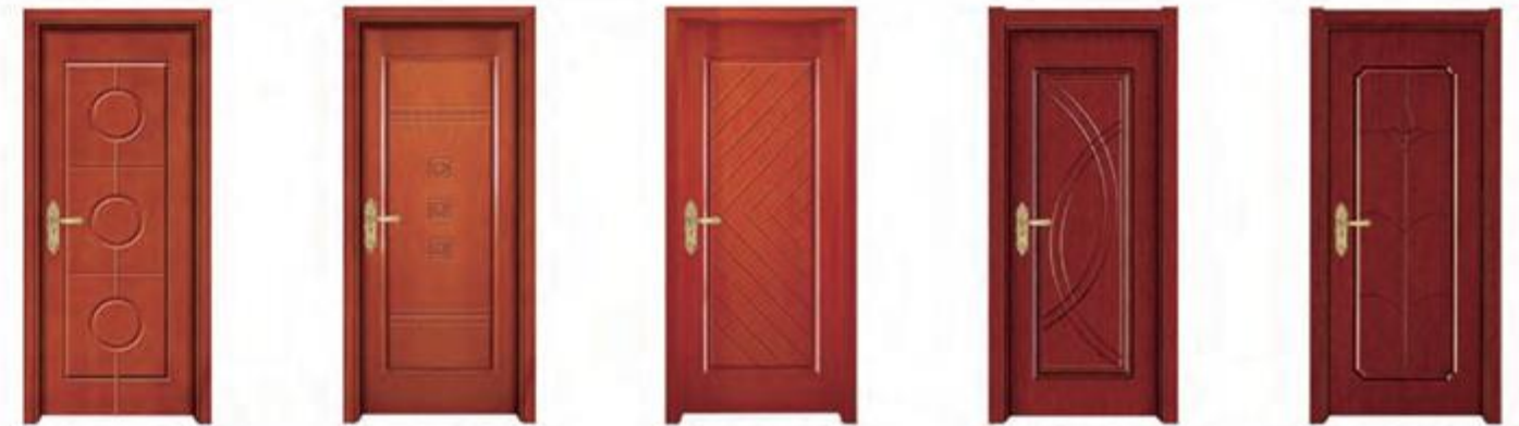
HTD-3001 HTD-3002 HTD-3003 HTD-3004 HTD-3005