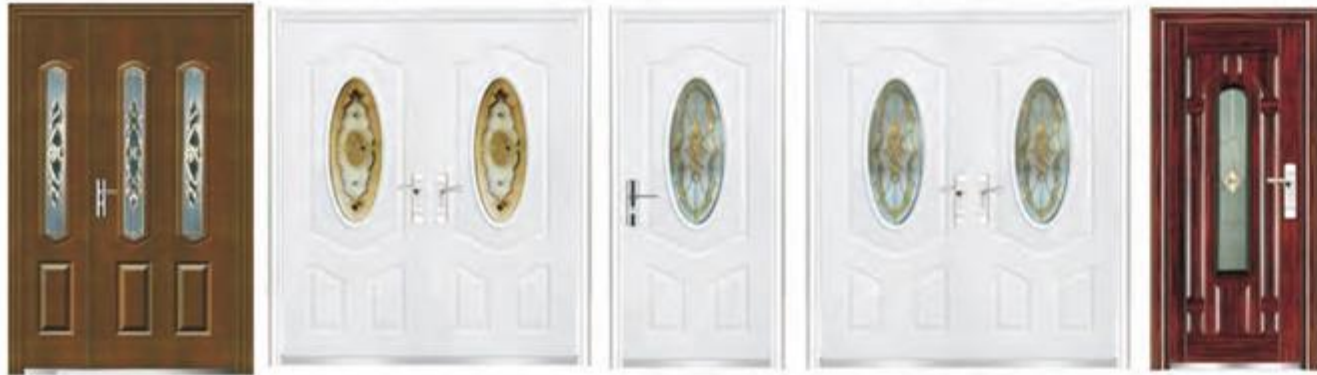
HTD-2081 HTD-2082 HTD-2083 HTD-2084 HTD-2085