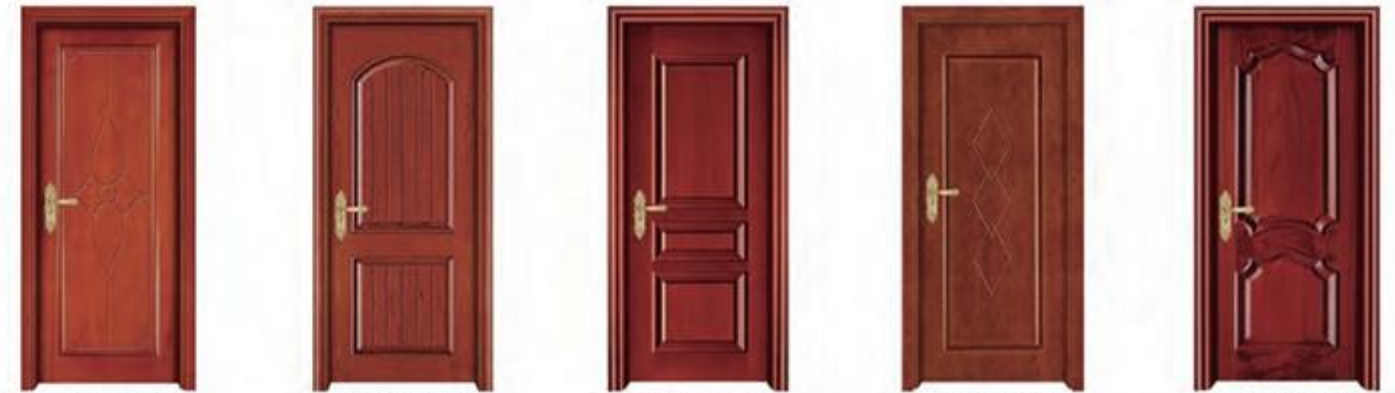
HTD-3006 HTD-3007 HTD-3008 HTD-3009 HTD-3010